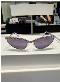
● sunglass hut